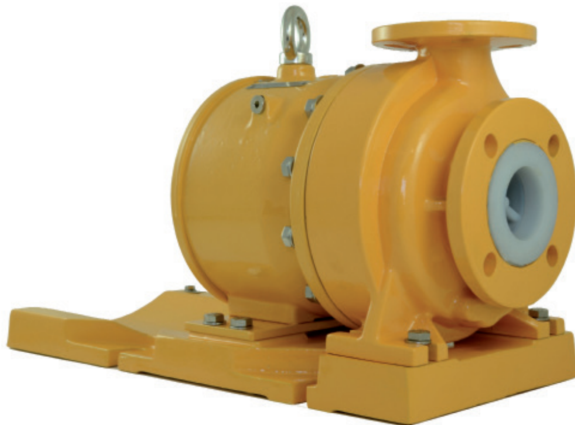
UTN-BL PFA CLOSE COUPLED EXECUTION

PFA Lined Magnetic Driven Pump - Single Stage - Process Centrifugal Pump Specifically designed for low flow applications, to cover flow range from 1 to 12 m 3 /h